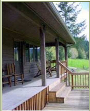
Leaping Lamb Farm Stay